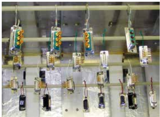
Storage of the test object during the mixed gas exposure