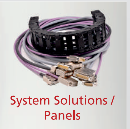
System Solutions / Panels