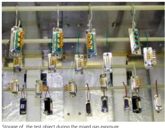
Storage of the test object during the mixed gas exposure